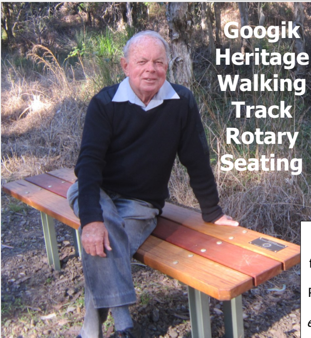
Googik Heritage Walking Track Rotary Seating

The RI President is also holding SIX Presidential Conferences this year, aimed at building peace. One will be held in Sydney (date tba). What a humble & inspirational RI leader we have in Rotary this year.