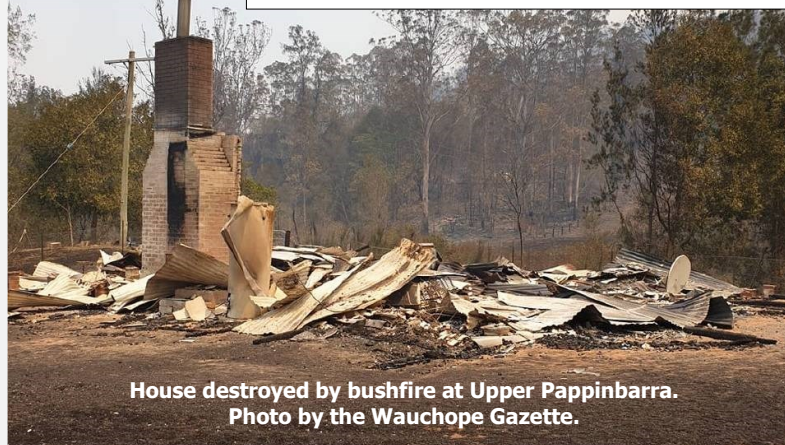
House destroyed by bushfire at Upper Pappinbarra.

With bushfires continuing to cause death and destruction within our region the question has been asked by many Rotarians as what we can do to help?