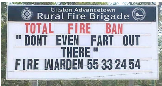
A notice board in Queensland during the recent fires.